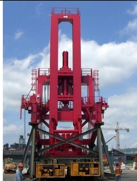
BOP TRANSPORTER / HOCHANG MACH (2008)