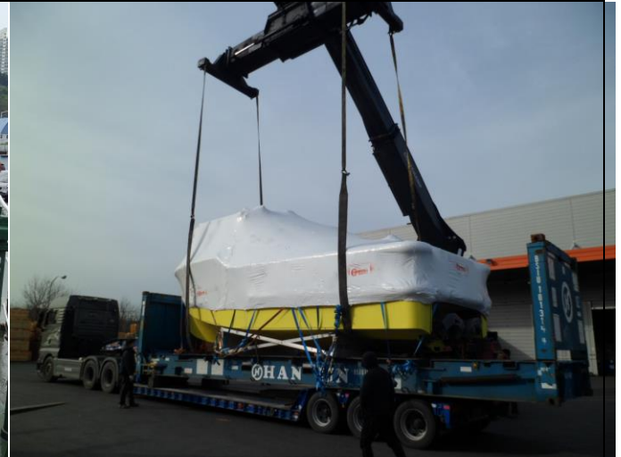
WORK BOAT / MITSUBISHI (2016)