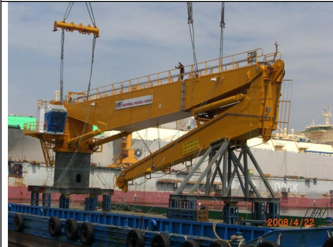
KNUCKLE BOOM CRANE / HOCHANG MACH. (2008)