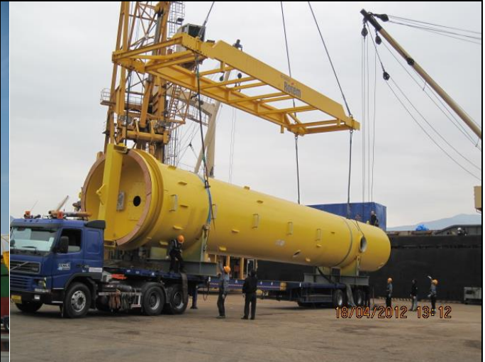
PEDESTAL / NOV KOREA (2012)