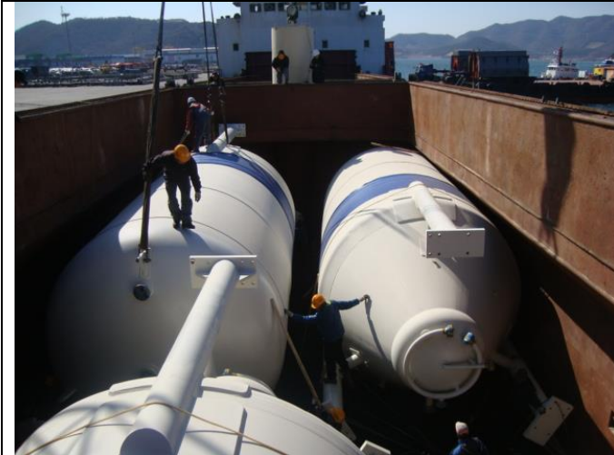
BULK TANKS / AKERSOLUTIONS (2010~11)