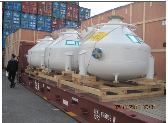
SURGE TANKS / Y&S (2011~2012)