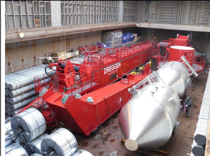
KBC / MCT ENG. (2011)