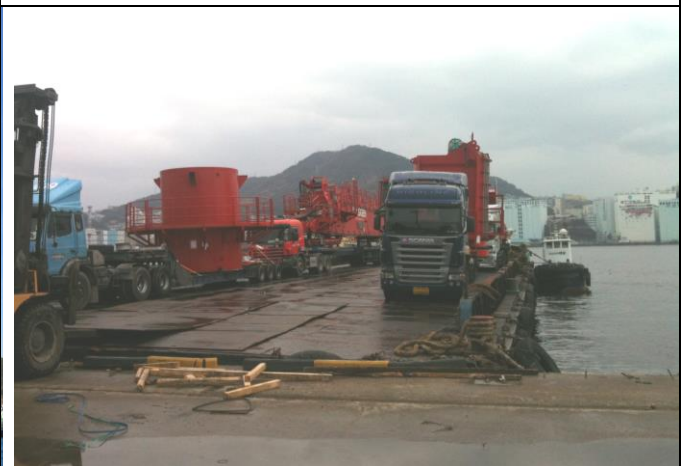
KBC (BY RO/RO) / MCT ENG.(2011)