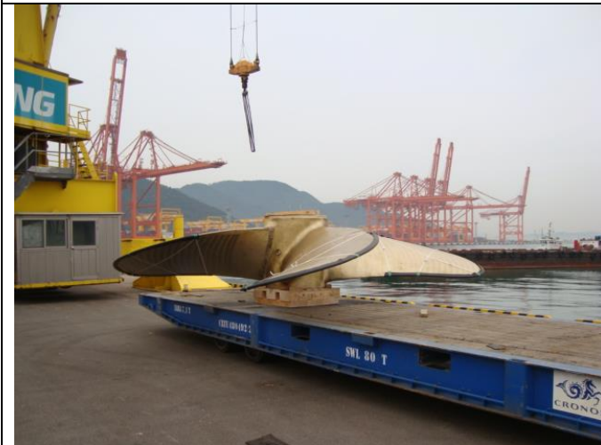
PROPELLER ON MAFI / DAEWHA ENG (2010)