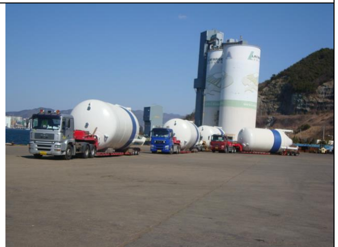
BULK TANKS / AKERSOLUTIONS (2010~11)