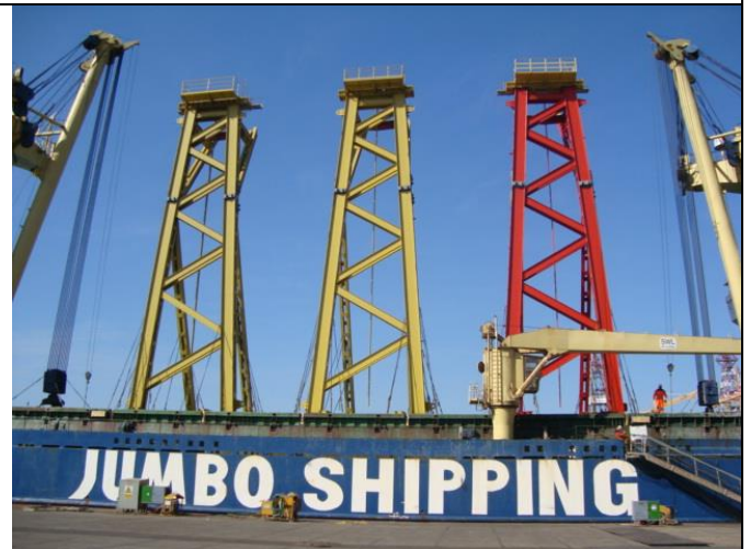
RGC (RISER GANTRY CRANE) CRADLE (2010)