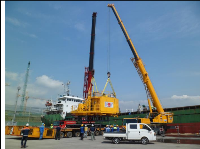
KING POST CRANE / NOV KOREA (2012)