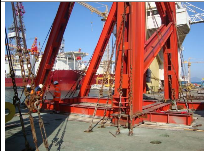
RGC CRADLE / AKERSOLUTIONS (2010~11)