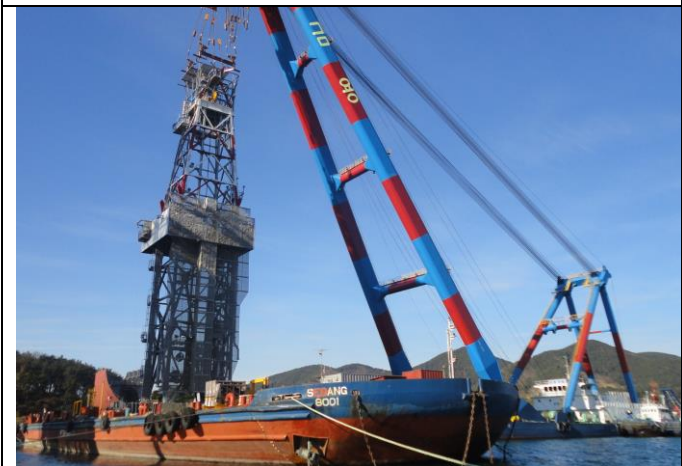
SWHE DERRICK / NOV KOREA (2011)