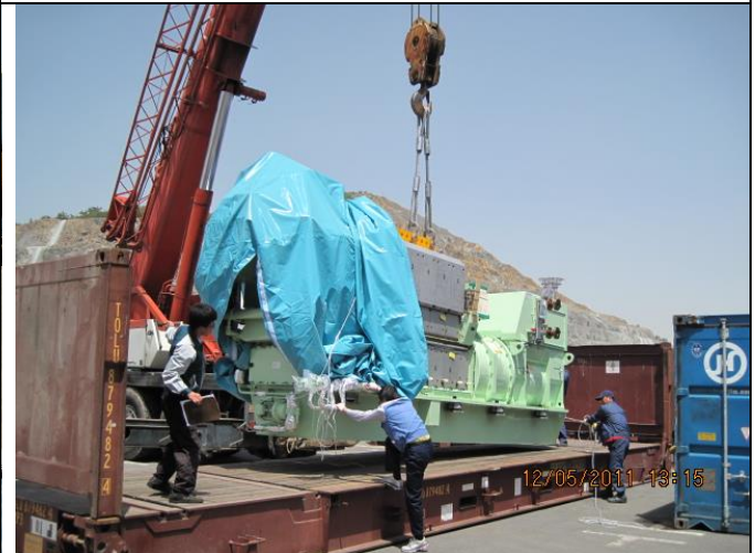
GENERATOR / STX ENGINE (2011)