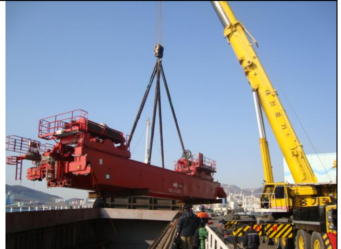
X-MAS CRANE / MCT ENG. (2011)