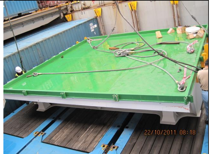
FRAME ON FR BEDS / ODFJELL (2011)