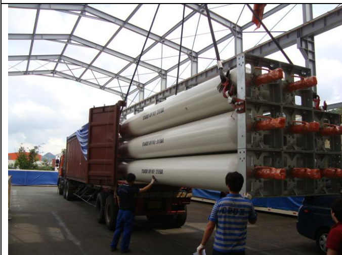
APV on OT CONT. / NK (2010~2012)