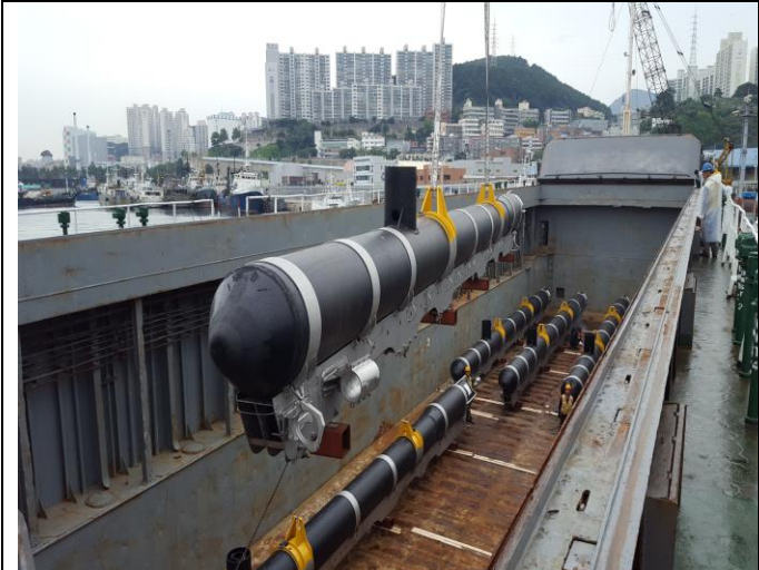
GUNFLOAT & KEEL / MITSUBISHI (2016)