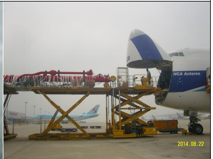
DAT Cylinder / AKER MH (2014)