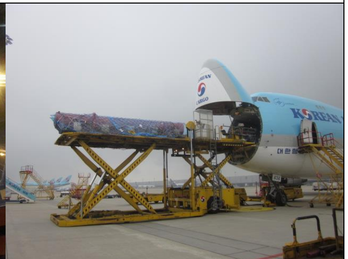
Accumulator / AKER MH (2013)