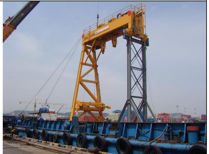
BOP OVERHEAD CRANE / HOCHANG MACH. (2008)