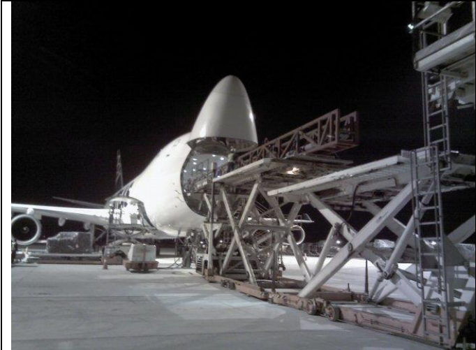
AIR CHARTER / DAT HOSES (2012)