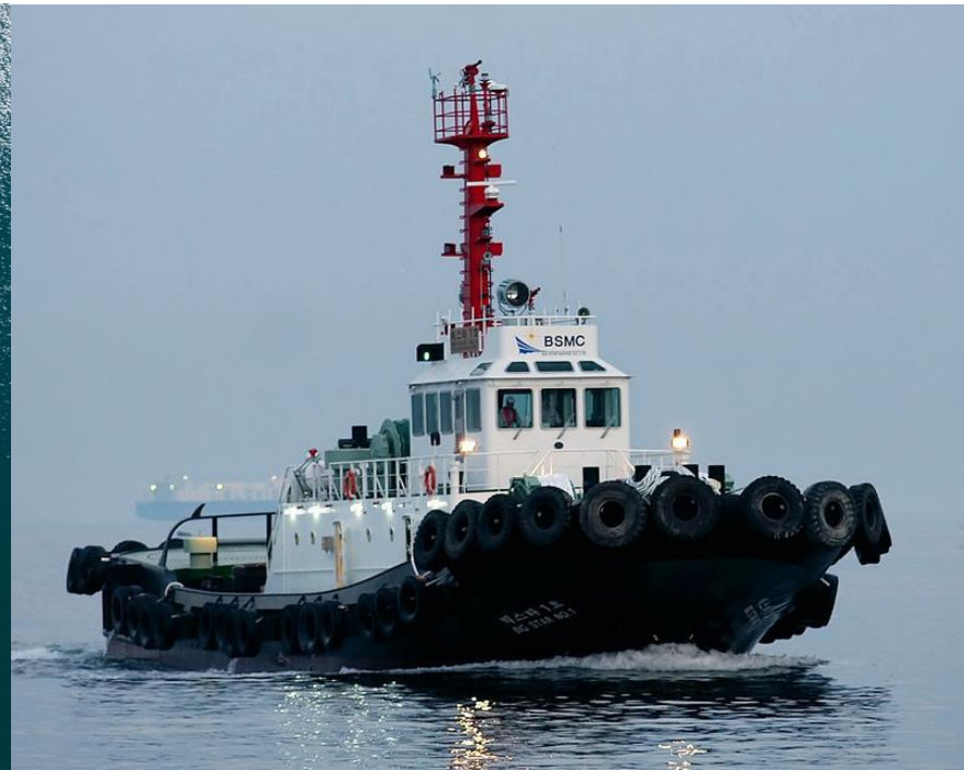
Float-on operation by GSSE